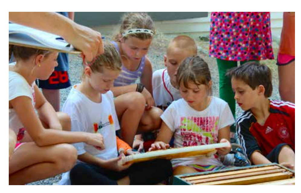
Kids examining honeycomb in our summer Farm Education program

Executive Director, Wright-Locke Farm amcintyre@wlfarm.org (781-760-1017)