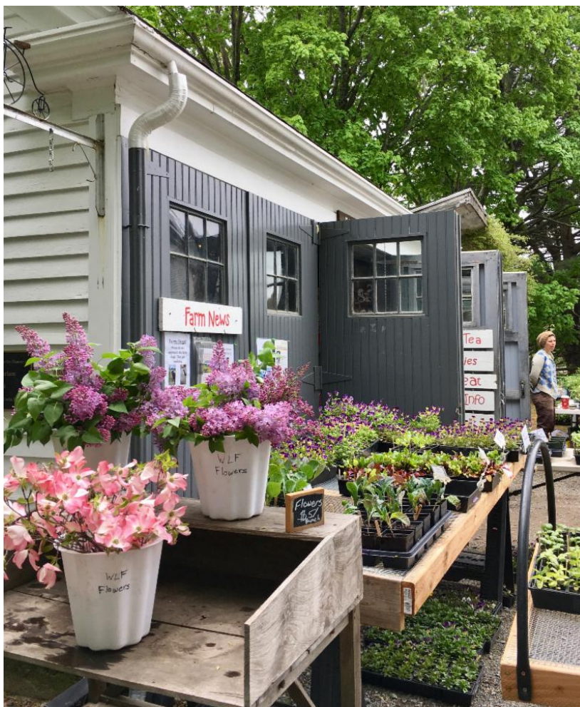
Farm Stand during our opening Spring weekend last year.