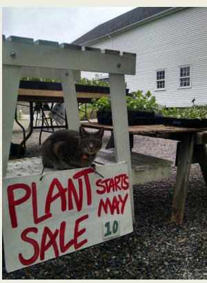
Barn Cat, Buddy, overseeing the Plant Sale during the weekend.

We're excited to welcome you back to the Farm Stand this year as we continue to develop this great little destination on the Farm.