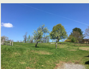
The beautiful old pear trees were flowering this week. Fingers crossed that we'll get some delicious pears this season.