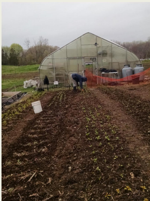
More flower weeding!