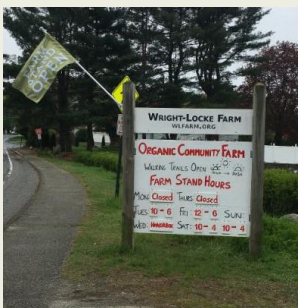
New Farm Sign by the roadside.