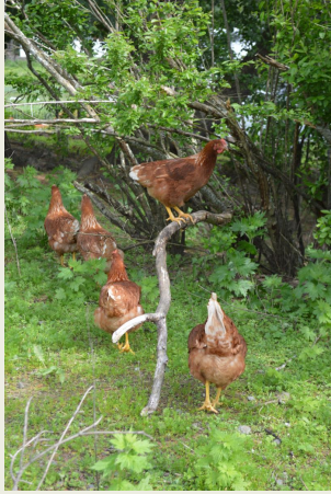
Pullets exploring their outdoor playground.