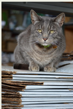
Buddy Cat guarding the CSA boxes