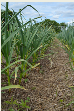
The Garlic is coming along nicely!